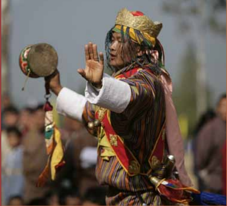
The Annual Gathering of Bhutan's Nomadic Highlanders